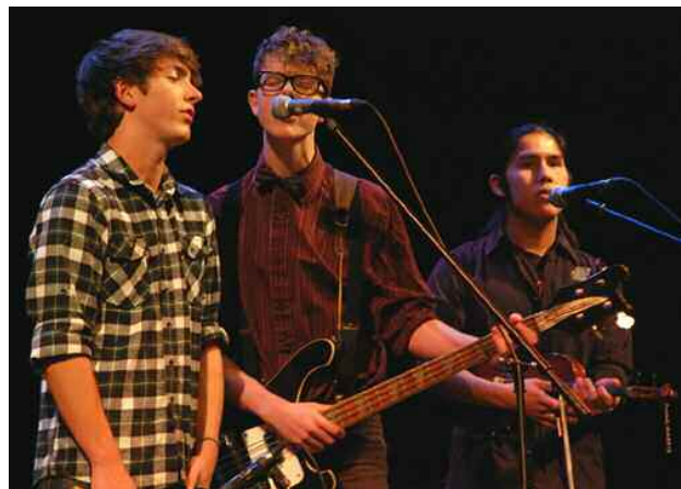
"Artist Party Revolution" - A GISS High School super-group performs at the SWOVA fundraiser in April

Thank you to all for your financial support and emotional support of the important work we do in preventing violence and teaching respectful communication.