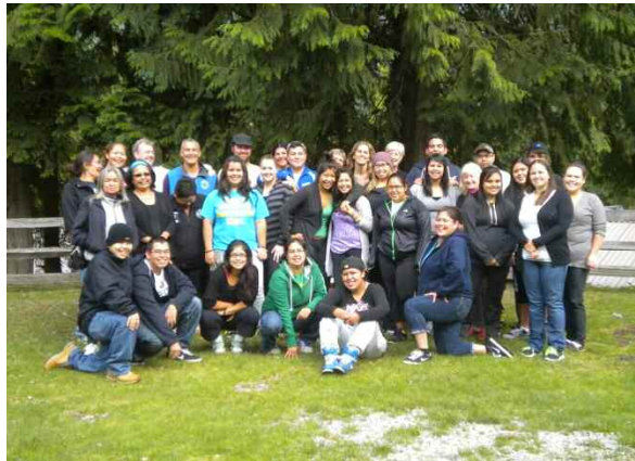
Participants in the Facilitator Training – October 2011

A new pilot project has been launched by Swova Community Development and Research Society working in partnership with the Musqueam Indian Band in Vancouver. An Aboriginal Respectful Relationships program has been developed and was delivered to Musqueam youth during the month of October 2011. Six Aboriginal women made suggestions for adapting the successful Respectful Relationships program curriculum to make it more relevant for Aboriginal youth.