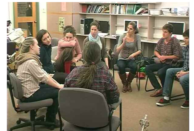
R+R Youth Team act out a scenario in the E-Learning program