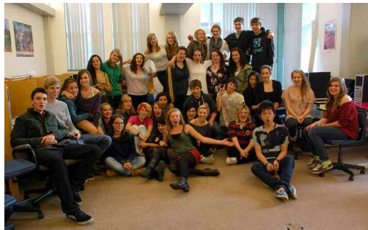
Some of the 2011 R+R Youth Team

"I joined the youth team because it is a very comfortable place and it brings lots of people together with the 'soul intention' of helping anyone and everyone. This is my second year being a part of the youth team and I have learned so much from it. I get to learn about pressing issues in today's culture and how to help and fix these problems. I also hope to get that satisfaction that you only get when you help someone. Being able to go to the middle school or the younger grades in the high school and address some serious problems that youth that age have today is going to help in more ways than one."