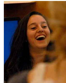
Youth Team Member at the weekly meeting

"I think this program is wonderful and I want it to continue through the years so my generation and the future generation will turn out to be the most respectful and peaceful people on the earth."