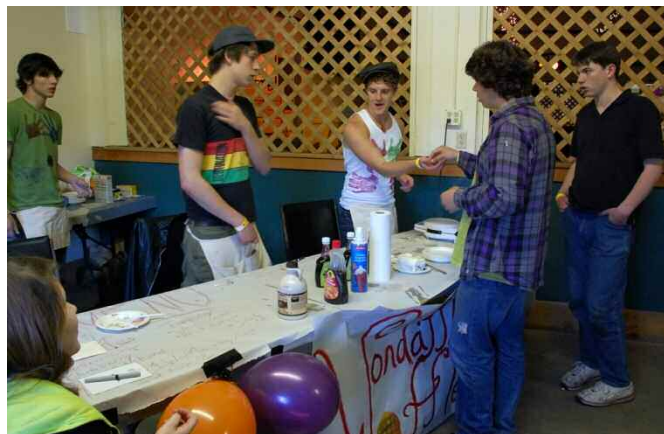
In May, Pass It On and R+R Youth organized "SparkFest" - a festival with fabulous music, local food, games and good energy.

Celebrate with us! This year we have achieved two of our strategic goals: we have launched a collaborative Respectful Relationships program for aboriginal youth with the Musqueam Band, and an e-learning training program for facilitators has been developed, tested and is almost ready for unveiling to the world. In addition, of course, we have continued to find funding to run the Respectful Relationships program at Gulf Island Secondary School which this year has a record number of 42 teens volunteering for the Youth Team, and to continue the successful Pass It On Girls program. All of these things have been accomplished because of our dedicated staff members as well as several consultants. The Board appreciates all the hard work, many hours, and passion our staff have for this work.