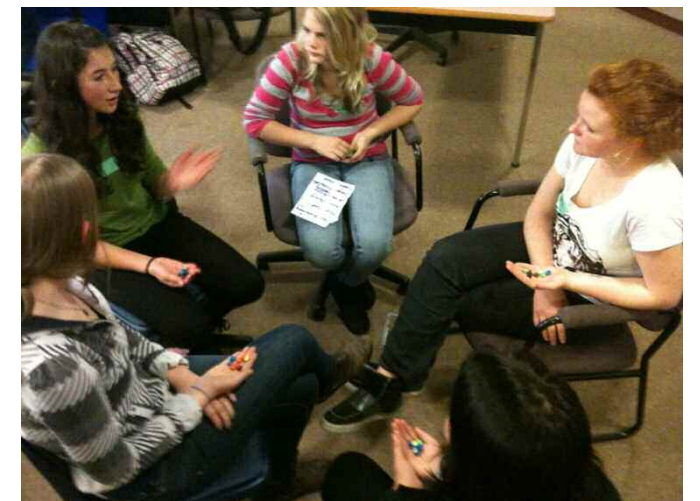
Mentors and Mentees meet at the High School